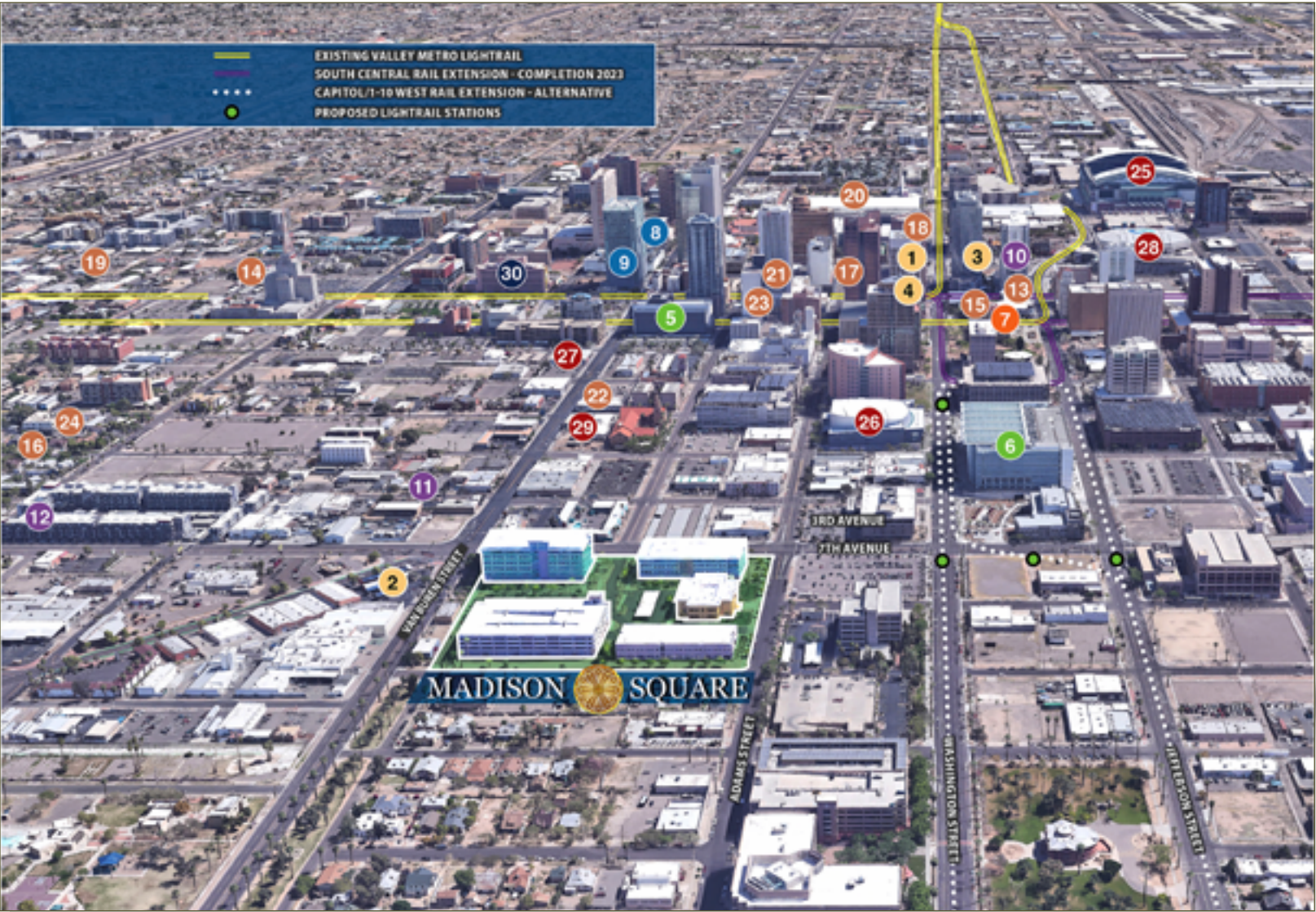
Amenities within 1 mile.