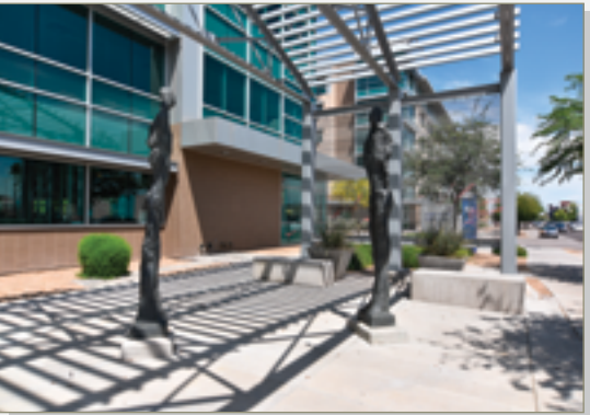
Art Sculptures Facing Seventh Avenue