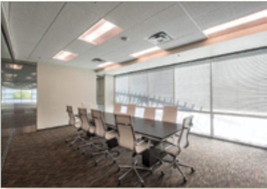
Conference Room in Second Floor Spec Suite